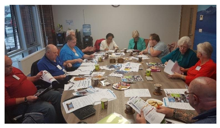
Our Communication and Events Working Group (CEWG)